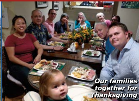
Our families together for Thanksgiving